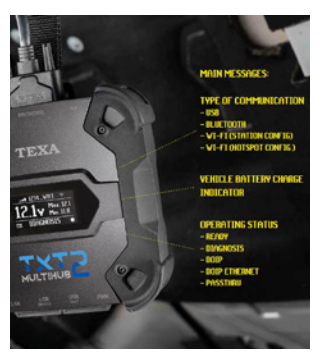
Backlit Display & Voltage Confirmation

RP1210, CanFD, DoIP, K-L, J2534, J1708, J1850, J1939 Ethernet, WiFi, Bluetooth, USB