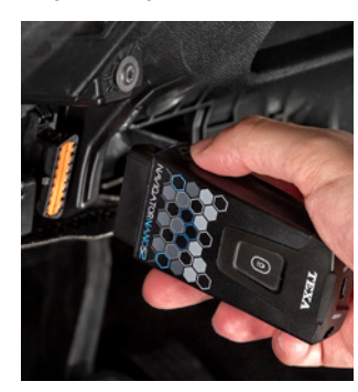
Optimize Data Download R G B Confirmation LED